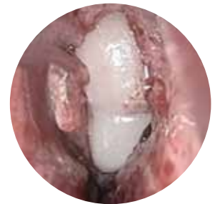
Intra-op view of SINU-FOAM